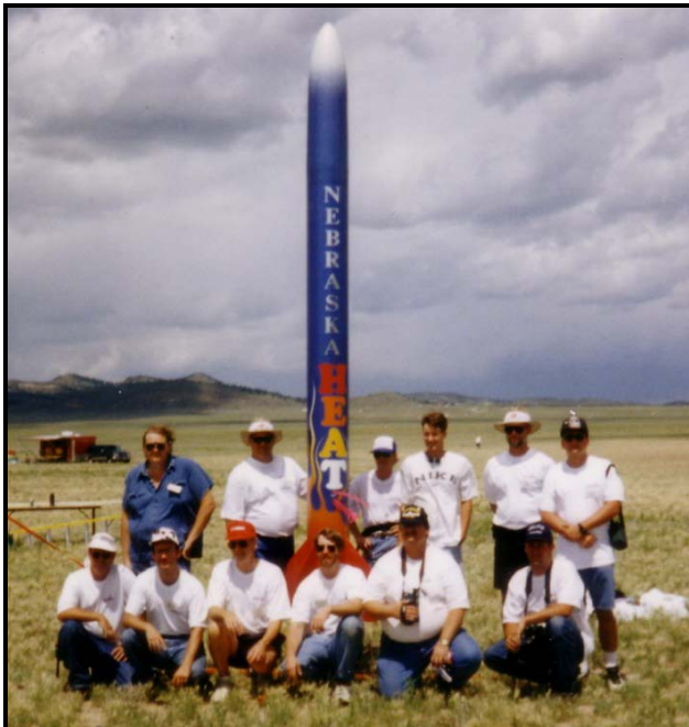
Group picture with the Nebraska Heat rocket at LDRS 16 at Hartsel, CO, 8/9/97.

The selection of Hartsel, Colorado as the launch site for LDRS 16 in 1997 started the planning for the first group project for Tripoli Nebraska in late 1996. This was the beginning for the now famous "Nebraska Heat" project and really brought the group closer with all of the planning and construction and kicked off our first actual Tripoli Nebraska group meeting which wasn't held at a launch.