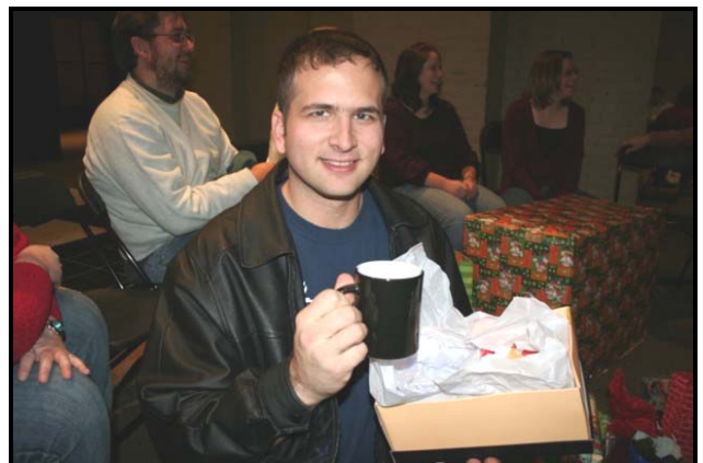
Coffee anyone? My most recent picture. (Burney)