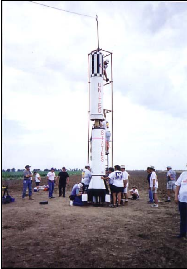
THOR's original 1/3 rd scale Mercury Redstone nearing final assembly on the pad at LDRS 18.

which represented Alan Shepard's Freedom 7 flight. The THOR Mercury Redstone was powered by a P13,000 made by John Johnson. The rocket was flown on Monday August 2 nd (EX day for LDRS). Due to a flaw in the motor design, the motor catoed, severely damaging the rocket. Parts of the rocket ended up in the hands of some the team members while the main bulk of the remaining rocket went into storage; what was left of the Mercury Redstone was disposed of in September 2006.