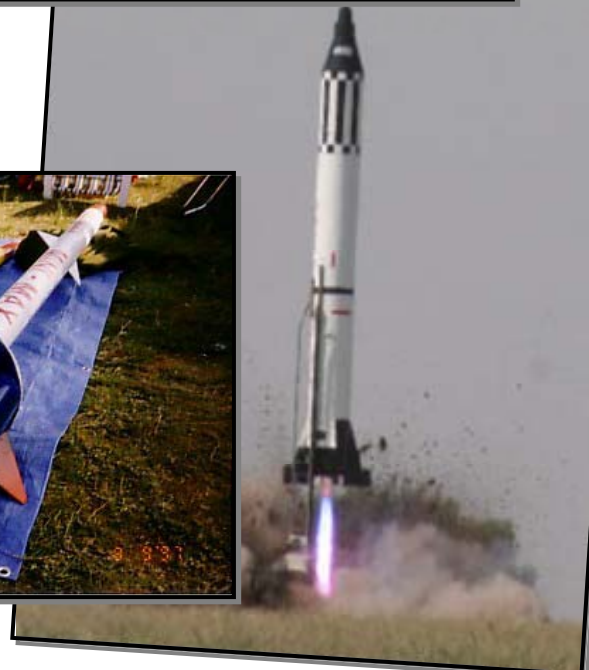
A look back at nearly two decades of THOR History.